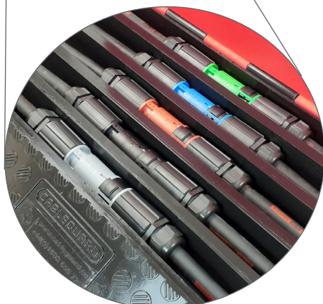
Capacity to house Powerline QC single pole connectors with 120mm 2 cable